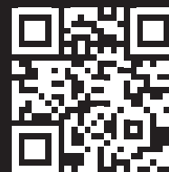
Ultimate Appearance Protection