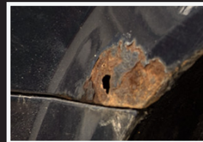
SURFACE CORROSION PERFORATION